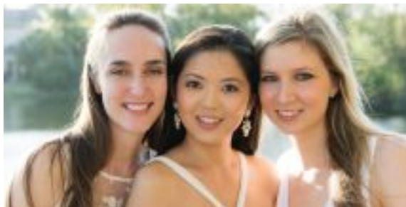
The Chrysalis Chamber Players

Chrysalis is the recipient of a Yale Alumni Ventures Grant, enabling the group to reach out to students through residencies in south Florida schools.