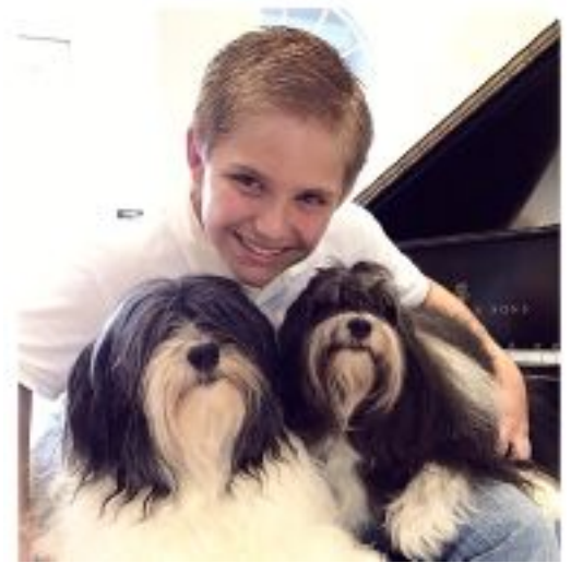
Noah, Bach and Mozart

Join us on Thursday, February 7th, at 7:30 p.m. in the auditorium!