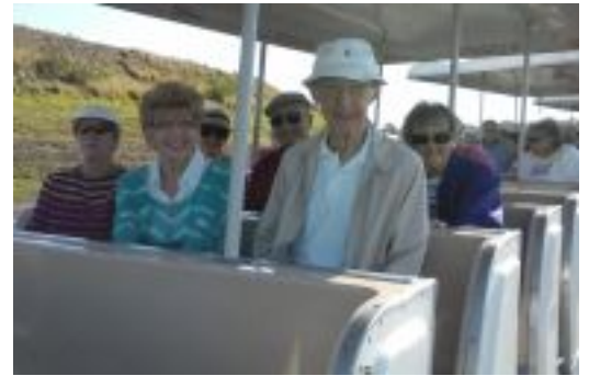
A Great Day Out To Port Manatee and Lunch at Cracker Barrel

members are in our area for about 10 days each year, sadly, so we must book them during that "window"). RAINBOWS for all the CDs everyone donated to Hospice! We collected hundreds for them to use in their music therapy program. RAINBOWS for our informative trip to Port Manatee!