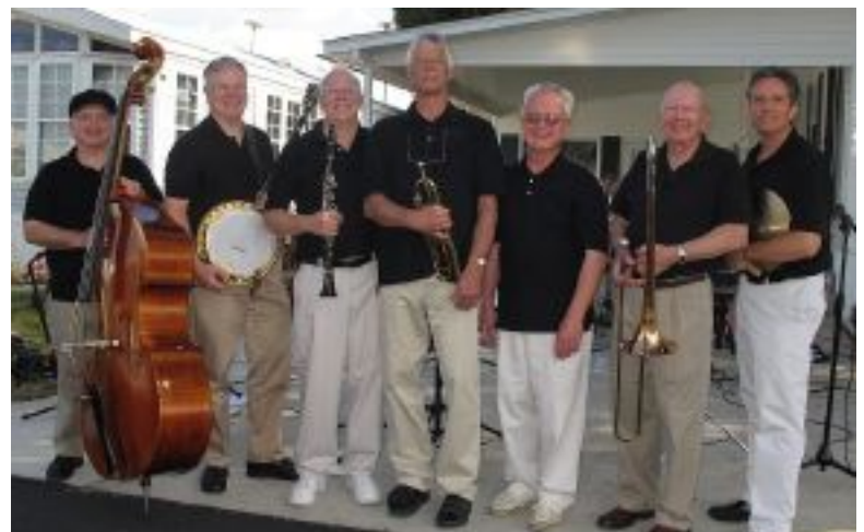
The CanAmGer Band

You can hear music samples and read the extensive background of each musical member at www.tradjazzbands.com . We also hung that information in the glass case across from the gift shop!