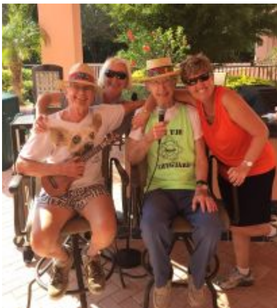
A ukulele player and a hot tub lifeguard showed up at the ice cream party!

This is the time of the year, when the weather is so perfect for outdoor activities. Take advantage of it!!!