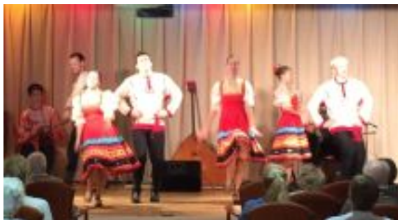
Everyone loved the Golden Gates Russian Dance Group!