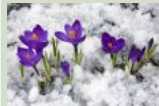
First Day of Spring: March 20