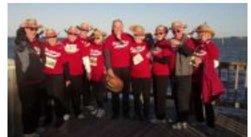
The BAY VILLAGE ROAD WALKERS