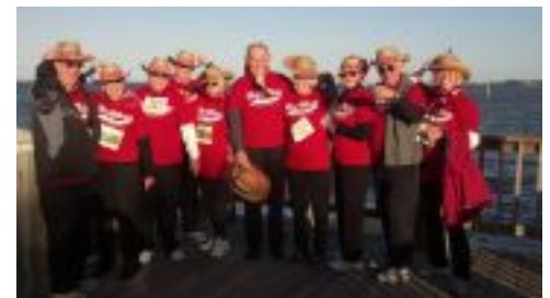
The BAY VILLAGE ROAD WALKERS