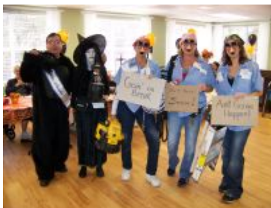
Bay Village Staff Costume Contest Winners!

As soon as we know which classes we will offer from Adult and Community Education in 2013, we will let you know.